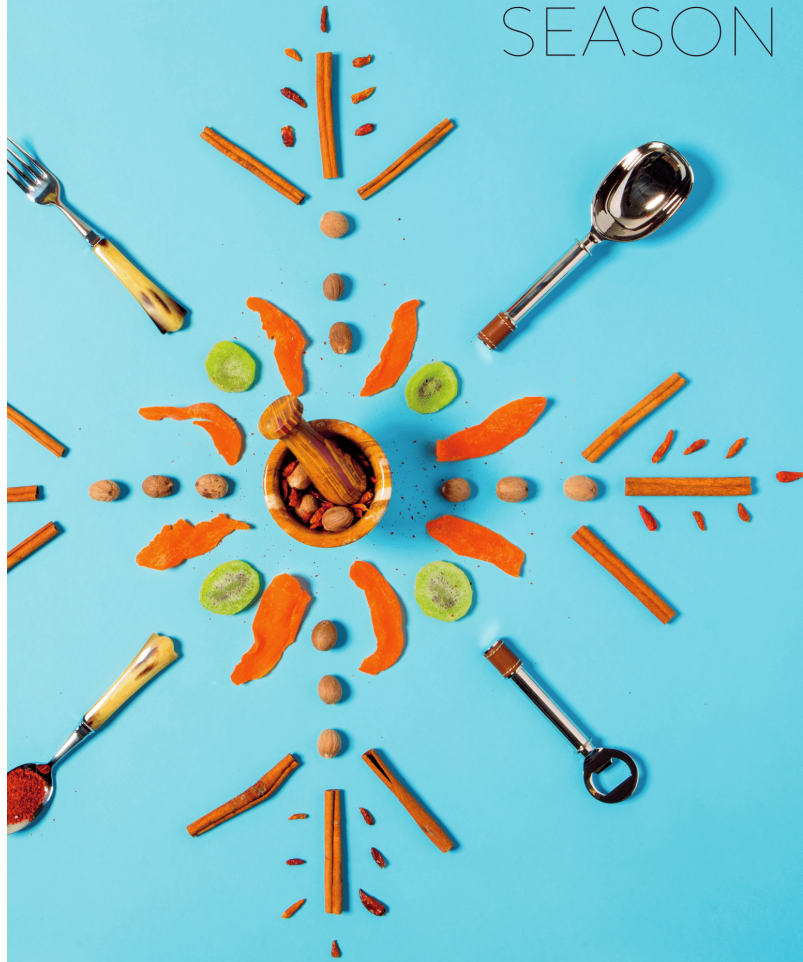
THIS PAGE Onyx Mortar and Pestle, The Spice and Tea Exchange, $36.95; Whole Nutmeg, The Spice and Tea Exchange, $0.79 each; Bird's Eye Chili Pepper, The Spice and Tea Exchange, $3.89, 1-oz. bag; Dried Mango, Morton's Gourmet Market, $4.99 each tub; Dried Kiwi, Morton's Gourmet Market, $4.59 tub; Ceylon Cinnamon Sticks, The Spice and Tea Exchange, $3.89, 1-oz. bag; Preston Stainless and Leather Bar Tool 3-piece Set, Black Bird Lifestyle, $95; Five-piece Ashanti Flatware, Malbi Italian Artisan Decor, $168.