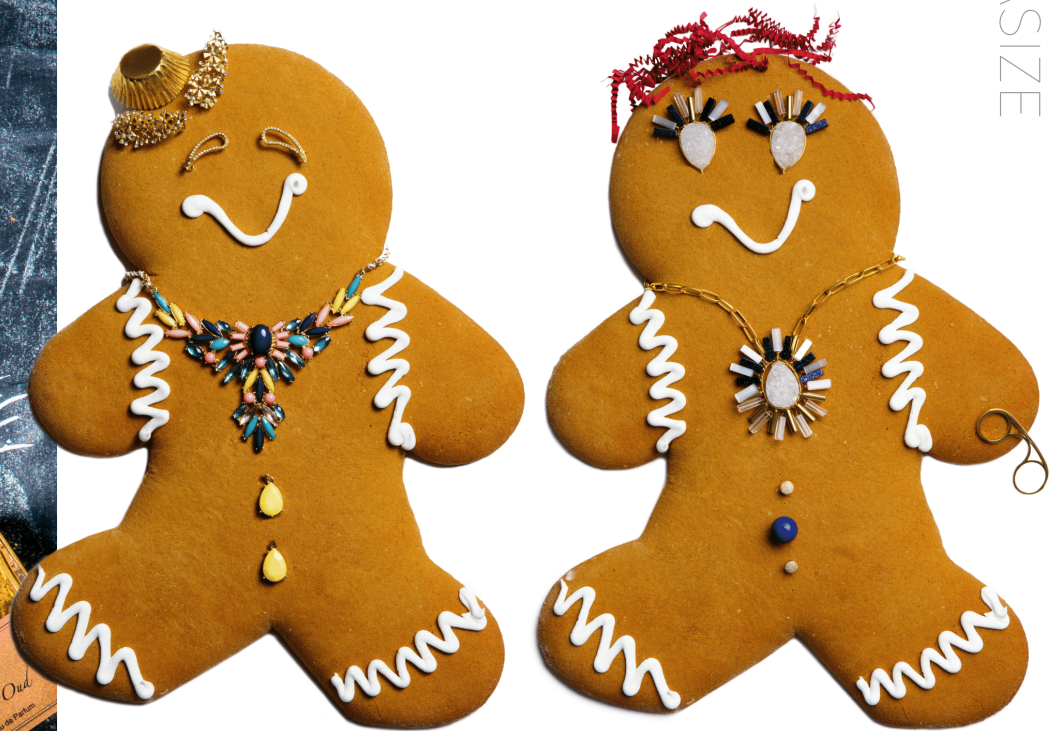
OPPOSITE PAGE French Hen Chalkboard, Sur la Table, $1799. Antique Imani Teacup and Saucer, Parker Robinson Interiors, $95 four-piece set. MADE in the Deep South Jewelry CeeKlace, L. Boutique, $328. Rose Oud 30 ml Nicolai Perfume, Parker Robinson Interiors, $80. THIS PAGE Oversized Gingerbread Cookie, Paisano's Italian Bakery, $75 each. Paisley Motif Ear Cuffs, Treat Boutique, $24 each. Floral Motif Ear Cuffs, Treat Boutique, $28 each. Gold Foil Bake Cups, Sur la Table, $2.95 Set of 32. Multi-Color Statement Necklace, Treat Boutique, $32. Opaque Yellow and Gold Earrings, L. Boutique, $28. Handmade Sarah Briggs Earrings, Treat Boutique, $108. Hand-made Sarah Briggs Necklace, Treat Boutique, $196. Shay Diamond and Gold Studs, Lotus, $938. Three-finger Gold Ring, Treat Boutique, $46.