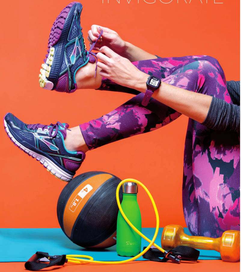
THIS PAGE The Mat 3mm, lululemon athletica, $58; Beyond Yoga Lux Long Legging, T. Georgiano's, $88; Brooks Women's Ghost 8 Shoe, Fit2Run, $120; SPRI 4-lb. Medicine Ball, Gym Source, $36.98; Garmin ForeRunner 25 Watch, Fit2Run, $169.99; Hampton 7.5-lb. Jelly Bell, Gym Source, $38; Vimma Doty Moto Jacket, Lotus, $178; S'well Water Bottle, Lotus, $25; SPRI Resistance Band, Gym Source, $14.99.